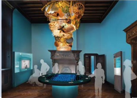
Game on barter versus money