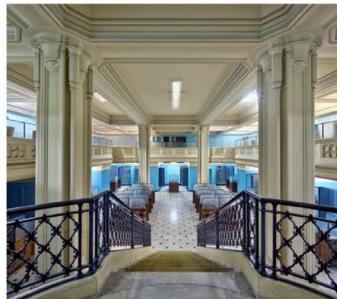
Art Deco safe deposit room