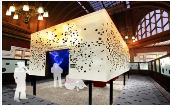
Decision Board (ext. view)