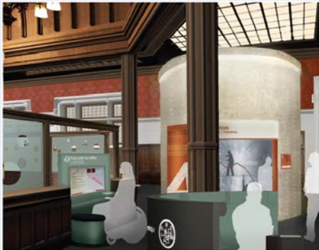
Debates (in every section)