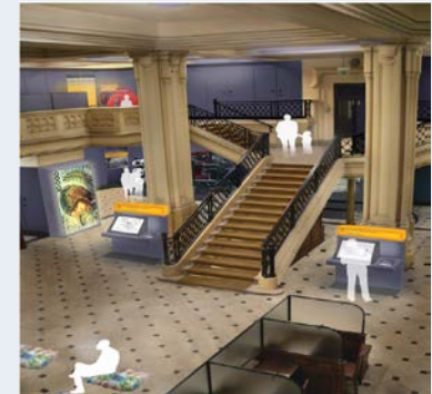
Safe deposit room with Gold