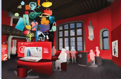
Consumer video & game