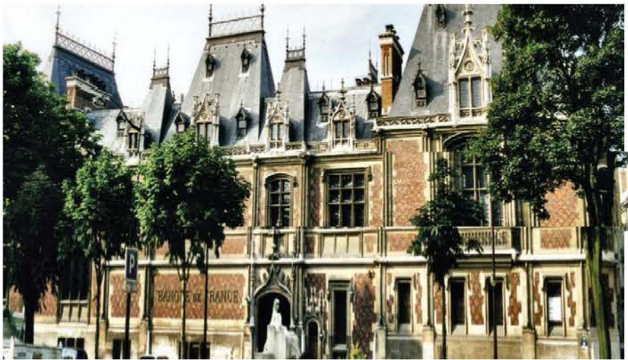
Façade and detail