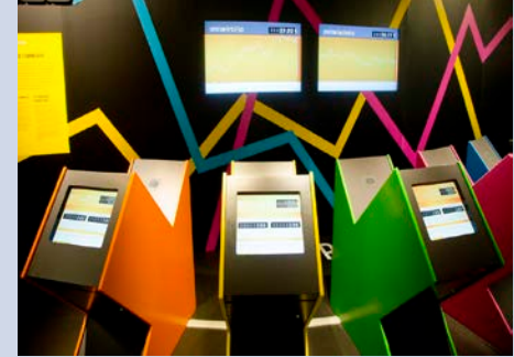
Stock Exchange Game